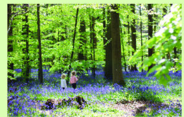
Bluebells in Angling Spring Wood, which bloom from late April into early May.

Find out more at lrbma.co.uk | visit chilterns.co.uk chilternsociety.org.uk | sustrans.org.uk